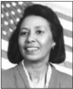
Yvonne Brathwaite Burke Supervisor, Second District